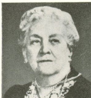
Mrs. Sara D. Roosevelt