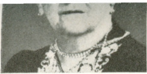
Mrs. Sara D. Roosevelt