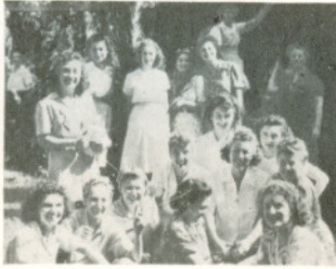
COLLEGE GIRLS BUILDING A SUKCOH

The Hillel Foundations are sponsored by B'nai B'rith to bring more adequate knowledge of their heritage to the Jewish Students on the University Campus. The units are supervised by trained professional directors who co-operate in the task of making Jewish religious and cultural values relevant for generation. Entertainment is also the Hillel vital and the college Entertain- a part of curriculum.