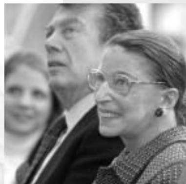
Hillel International Board of Governors Chairman Edgar M. Bronfman and Supreme Court Justice Ruth Bader Ginsburg at the dedication.