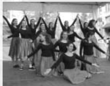
B'Yachad, the Brandeis Hillel Israeli Folk Troupe, performs at the dedication.