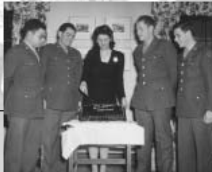
Hillel sponsors a Seder for military trainees at College Station, Texas in 1945 (background) and sends them off to war from Indiana University.